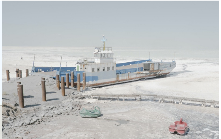
⬆ L: Map of Lake Urmia; R: An abandoned ship stuck in Lake Urmia

and activities by young people to protect Kurdistan's nature. Local residents also self-organize for firefighting to protect the region's forests and wildlife.