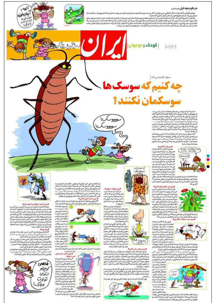
Cockroach cartoon in Iran, May 12, 2006.

In addition, university students conducted a letter-writing campaign to the offices of Iran's president, the Majles, the Friday sermon leaders, and the governors of East Azerbaijan, Zanjan, and Ardabil provinces. The letters condemned the survey and called for the right to use and study the Azerbaijani language at Tabriz University. 70